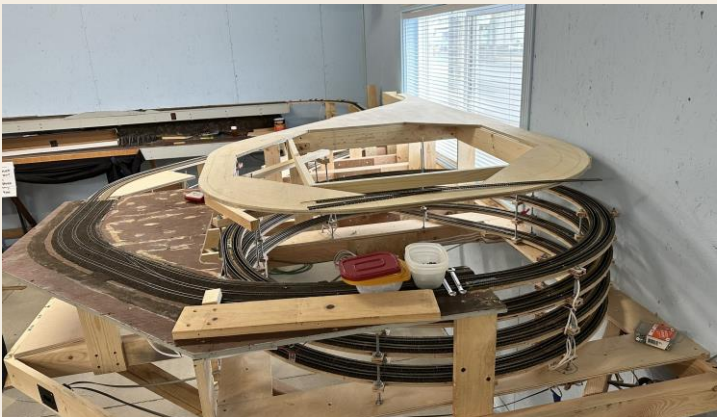
The N Scale Logging Mountain during the build.

In days of old, you moved a lever on a transformer and all the trains on the track took off. Today on several of our layouts, technology has stepped in and now we control each locomotive separately. Through a hand-held throttle or cell phone, we control the locomotives speed and direction. Some locomotives even have sound, not only the horns and bells but the engineer walking to the locomotive on gravel or the fire door on a steam engine shutting. Anytime you are visiting and are curious, just ask one of the club members to show you around the "underside".