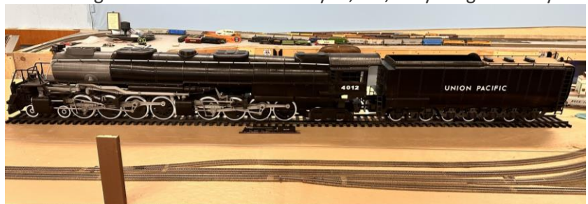
The “Big Boy” display.