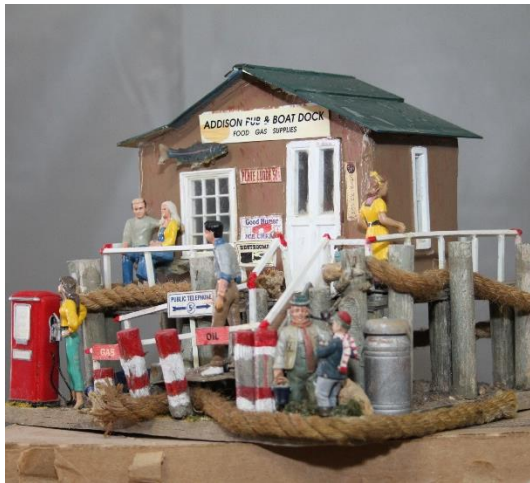
G Scale scenery building

When the crossing light by the caboose are flashing, someone is in the building running trains. Come on in and see what is going on. There is never an admission charge to watch the trains. We are here for the enjoyment of the Magic Valley communities. Who knows, you might find something interesting.